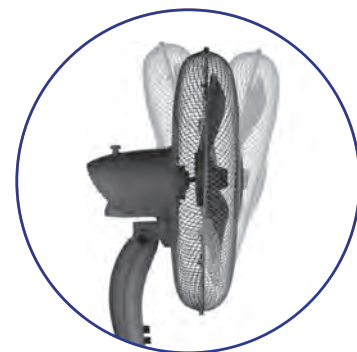
30° TILT OSCILLATION