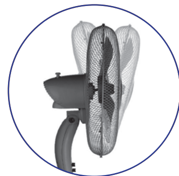
30° TILT OSCILLATION